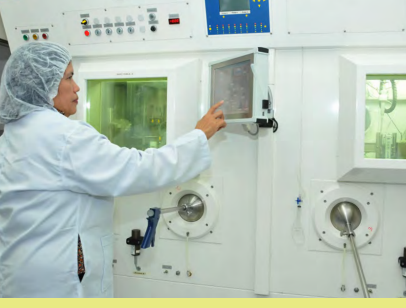
Molybdenum-99/Technetium-99m Generator Hot Cell Facility

The Philippines will soon have the capability to locally prepare and produce the most commonly used medical radioisotope with the setting up of Molybdenum-99 / Technetium-99m generator production facility at the Department of Science and Technology - Philippine Nuclear Research Institute (DOST-PNRI). Currently, government/private hospitals import Technetium-99m (Tc-99m) generators from overseas.