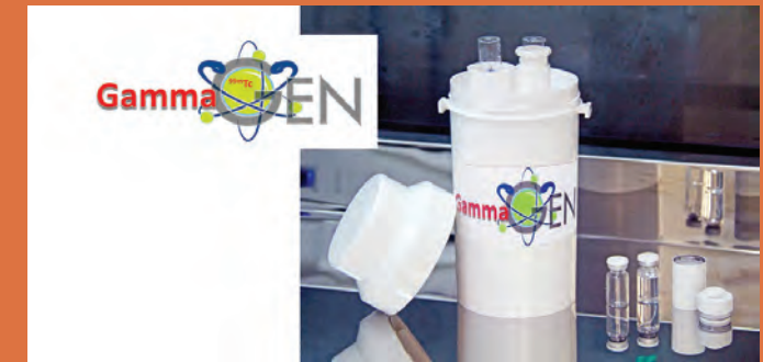
The trade name for the Technetium-99m generator

purposes. Its gamma energy of 140 kiloelectron volt (keV) and half-life of six hours (meaning that after every six hours, the radioactivity is reduced by half) makes it a suitable tracer that can be detected by gamma cameras. The short physical half-life and biological half-life of one day allows fast scanning and low radiation