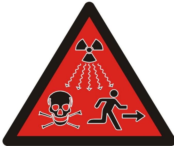
Fig. 1: ISO 21482:2007 Ionizing-radiation warning -- Supplementary symbol